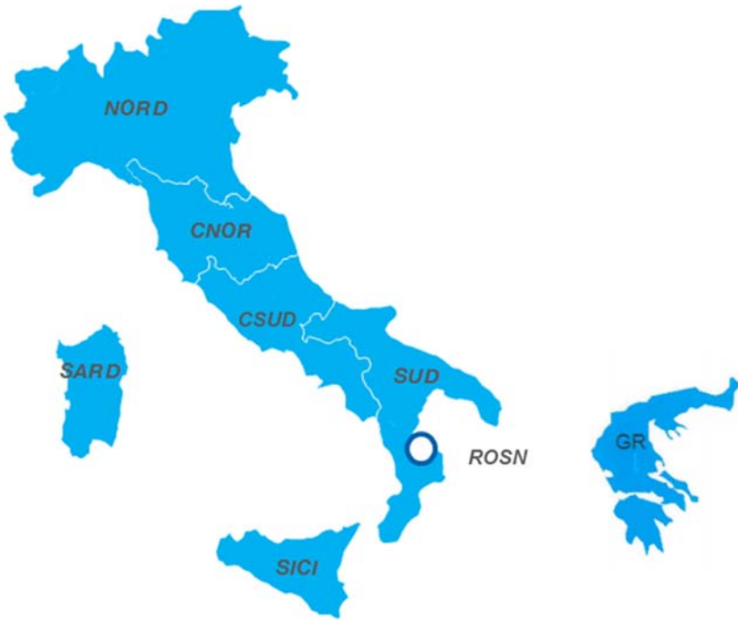
Map 2: GRIT CCR