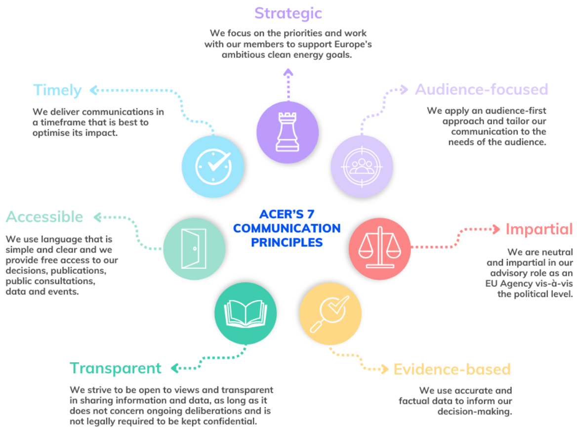
Figure 1: ACER’s seven communication principles

Our shared commitment to these communication principles (shown in Figure 1) allows us to work together to achieve our communication goals.